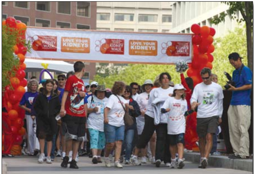
Start of Kidney Walk at Cityview Plaza San Jose, CA

On the East Coast, BPG and many of its vendors, tenants and service providers will once again partner with the National Kidney Foundation on October 4, 2009 for the 8 th Annual Kidney Walk at the Philadelphia Zoo.