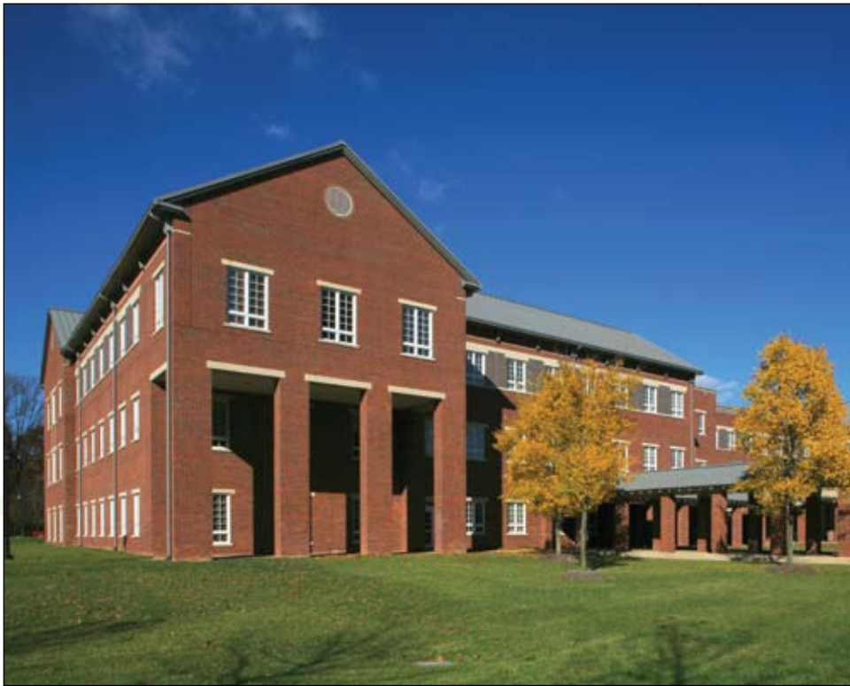
Tower Point at the Highlands, 930 Ridgebrook Road, Sparks, MD

The 60-acre corporate park is in close proximity to Hunt Valley Towne Centre, a new lifestyle center offering a wide range of eateries and shopping opportunities. The surrounding area includes some of the most exclusive housing in the Baltimore suburbs. ■