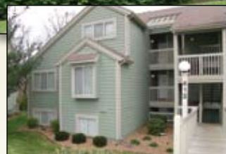
Madison at Woodlands, Kansas City, MO