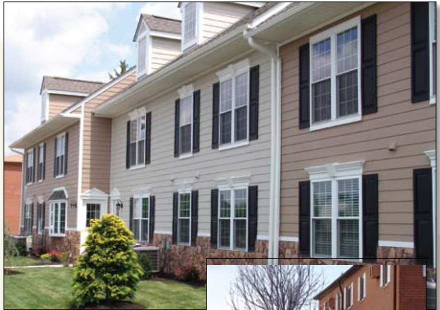
AFTER ^ BEFORE >

Community and resident reaction to the renovations has been overwhelmingly positive. Despite the on-going construction during the past year, leasing has been strong with an average of three leases per week with rents starting at approximately $1,000 per month. ■