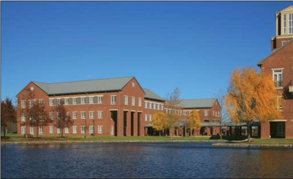
Tower Point at the Highlands, Sparks, MD