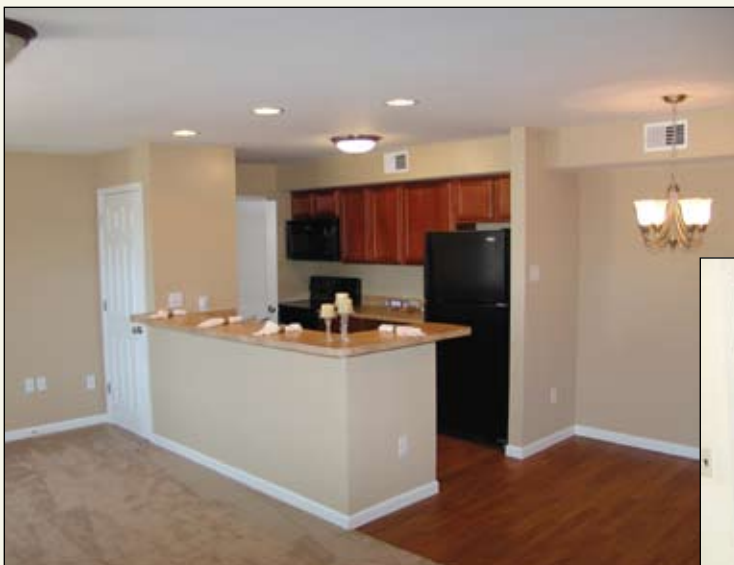
< AFTER v BEFORE