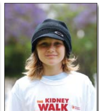
Photos above show Kidney Walk volunteers and participants at Cityview Plaza, San Jose, CA